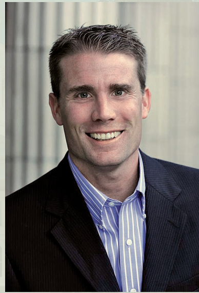
Senate Pro Tem Designee Mike McGuire